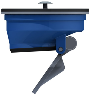
Reg. Design Application